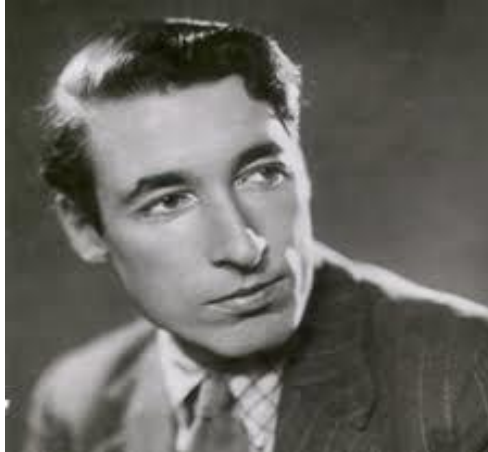
FREDERICK LOUIS MACNEICE(1907-1963)

“The poet is a maker, not a retail trader.”