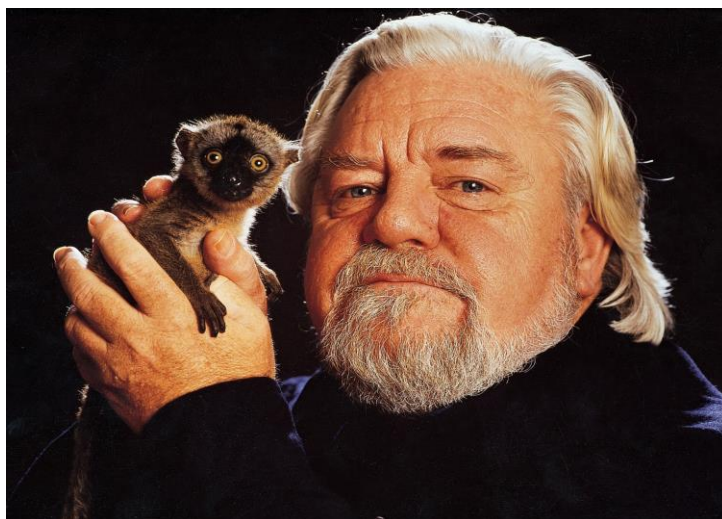
GERALD DURRELL (1925-1995)

“Until we consider animal life to be worthy of the consideration and reverence we bestow upon old books and pictures and historic monuments, there will always be the animal refugee living a precarious life on the edge of extermination, dependent for existence on the charity of a few human beings.”