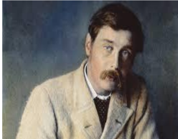
HERBERT GEORGE WELLS (1866-1946)

“We all have our time machines, don’t we- Those that take us back are memories...And those that carry us forward are dreams.”