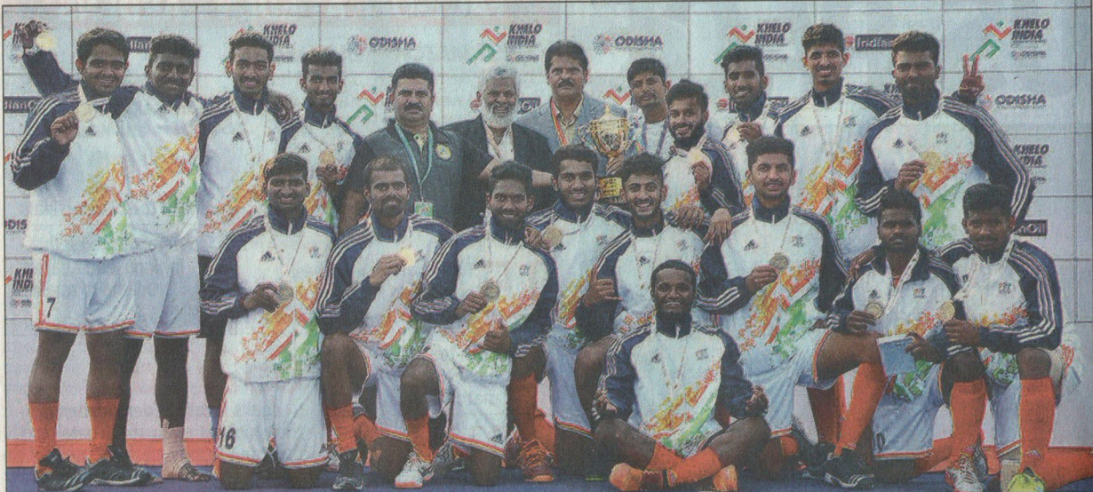
CHAMPION CLASS: The victorious Bengaluru Central University team